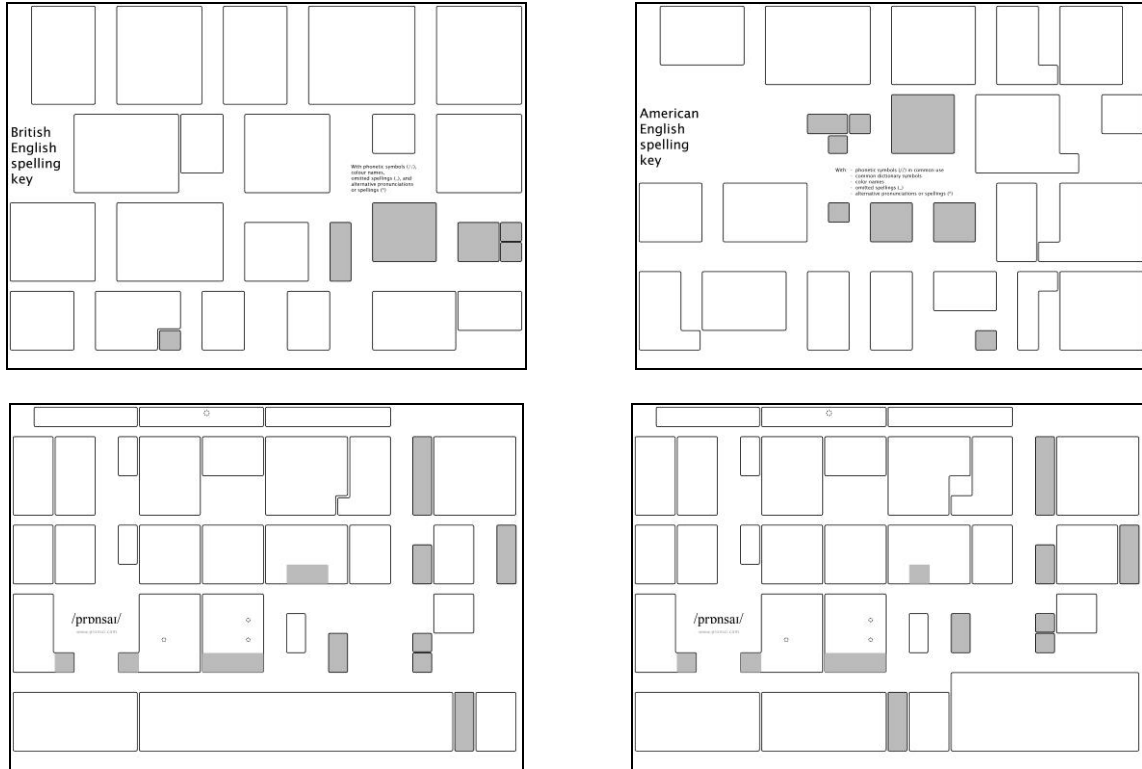
Vowel section above, consonant and reduced sound section below

In these situations, the letters are coloured, from top to bottom, for the two or more sounds they represent. The areas where these appear are shown in grey below (overlaid on the layout of the Keys for British English, left, and American English, right).